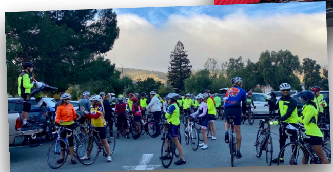
50 cyclists ready for the 60 miles from Martinez to Davis