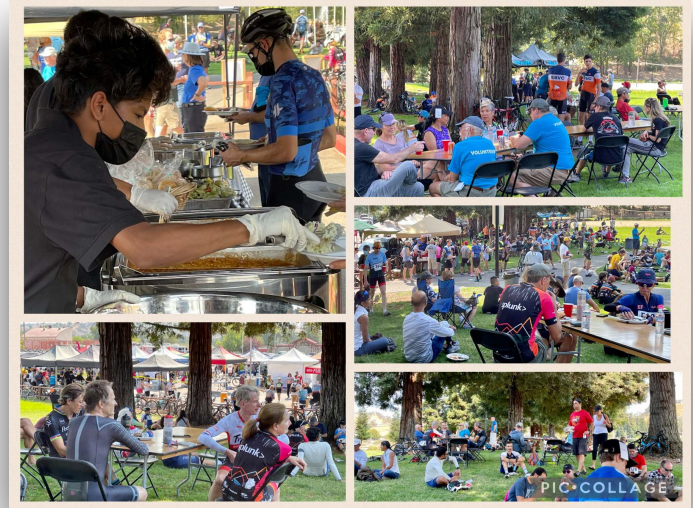
Cyclists enjoying a leisure BBQ picnic after MDC at Stone Valley Community Park

who made the Challenge a success. Food, drinks, and camaraderie are always part of our various ride events! Mark your calendars for Sunday, October 2, 2022 for next year's event. Go to www.mountdiablochallenge.org for more information.