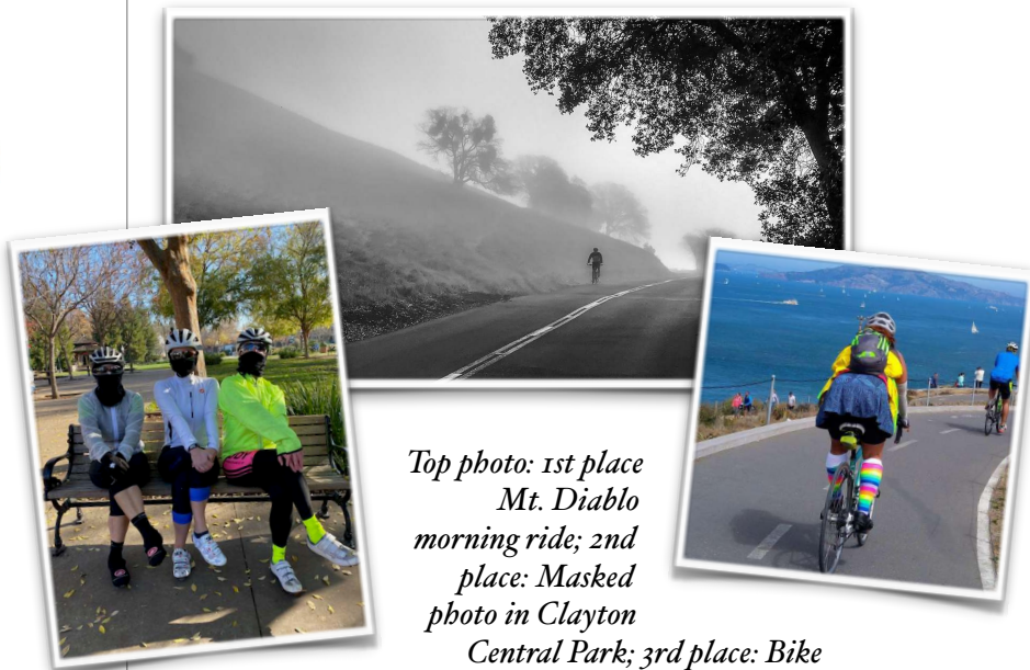
Top photo: 1st place Mt. Diablo morning ride; 2nd place: Masked photo in Clayton Central Park; 3rd place: Bike Trail at south end of Golden Gate Bridge.

April is the last month of the VSBC Photo Contest and we will miss seeing the beautiful, fun and interesting photos members have submitted for their rides. It reminds us that not only do we ride for fitness reasons but because we love the scenery, the camaraderie and the beauty. Here are some more photos to enjoy: December 2020 Winners