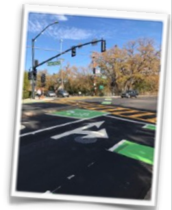
New bike box at the intersection of Green Valley Rd & Diablo Rd. in Danville.

While bike events and formal club rides have been suspended due to the pandemic, it's nice to be able to report that some great bicycle infrastructure projects have been moving ahead in Danville and San Ramon. One project recently completed is the upgrade of bicycle lanes and facilities on Diablo Road between Hartz Avenue on the west end and Green Valley Road at the east end. About a year ago, Danville planners reached out to Mount Diablo Cyclists (MDC) and VSBC to provide input on the plans for this upgrade. With the town's proposed project map in hand, Alan Kalin representing MDC and I ( Mark Dedon ) visited each proposed bike lane upgrade location and offered our input. The town's planning team was very appreciative and now it's great to see new striping, signs, and bike-sensitive signal lights.